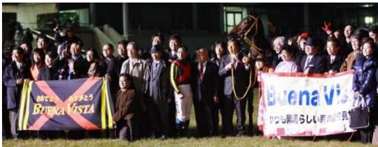
Fans say goodbye to Buena Vista