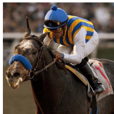
The Factor

Out of the box like a shot from his far outside post, The Factor was unhurried by Martin Garcia, conceding the early edge to a headstrong Centralintelligence (Smarty Jones). The Factor soon grew restless, however, and he ranged up three-wide to contest an opening quarter in :22.61 with stablemate Hoorayforhollywood (Storm Cat) also in hot pursuit. Centralintelligence began throwing his head about inside approaching the half, and quickly dropped back to last after bothering Hoorayforhollywood , giving The Factor a clear lead of about a length and a half turning for home. Rothko , who also encountered a bit of trouble during the incident with Centralintelligence , appeared in with a chance to run down The Factor in the lane, but his challenge was quickly dismissed and the favorite was home free. Associate came from last to grab a piece. Centralintelligence was eased out of the race, but did not appear to be injured. The Factor's winning time of 1:19.89 was .19 seconds off the track record set by Twirling Candy in last year's Malibu.