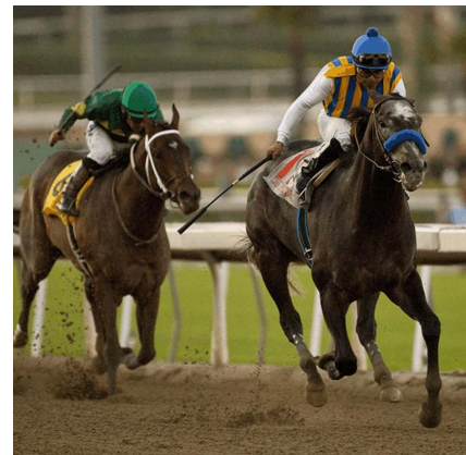
The Factor Denies Rothko

A crowd of 44,579 were on hand for Santa Anita's traditional opening day card--the most since 1994.