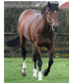
Volksraad (1988-2011)