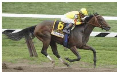
Turbulent Descent