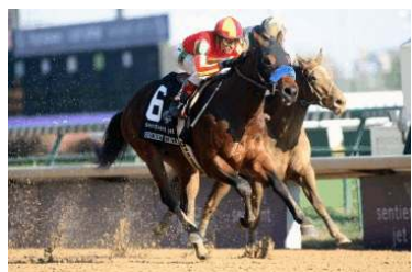
Secret Circle