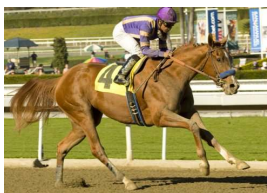
Princess Arabella