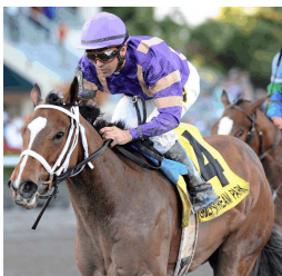
Sacristy

Sacristy began her career with a pair of runner-up efforts over synthetic surfaces at Arlington and Keeneland before graduating by 6 3/4 lengths over the dirt at Churchill Downs last time out Nov. 10.