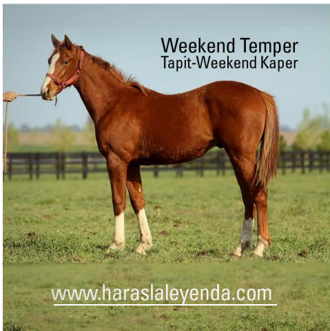
Weekend Temper Tapit-Weekend Kaper

WHICH SIRES ARE HOT AND WHICH ARE NOT? CLICK HERE TO FOR TDN INSTA-TISTICS