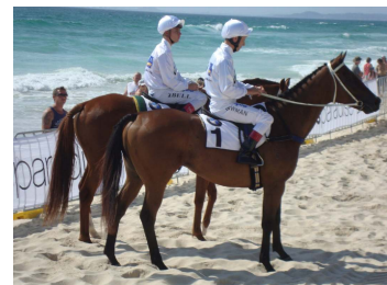
Thoroughbreds on the beach

Probably at about 10 p.m. Monday night, I found myself pondering, 'Why on earth did Magic Millions schedule the barrier draw (held on the beach at Surfer's Paradise for the first time) at the painfully early time of 8 a.m.?' The thought was very likely due to my yearning for a little more sleep after a pretty late night (as they say, when in Rome..), but let me tell you, I got my answer the moment I rolled out of the hotel shortly after 7:30 a.m. I was told it was already 29 degrees (high 80s) by the time the event kicked off, and more than a few people were showing significant signs of the heat by the time the barrier actually commenced. The day's temperature maxed out in the vicinity of 34 degrees. That said, I'm guessing nobody, especially those smack in the middle of winter in the Northern Hemisphere, is feeling too bad for me at the moment. Cont. p19