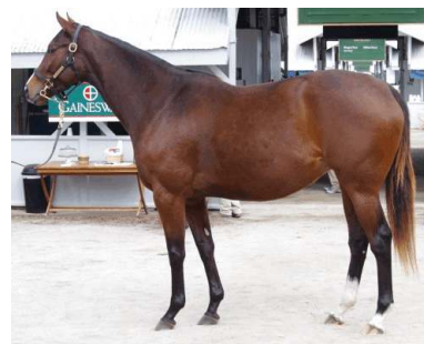
Touching Beauty

Just four hips after selling a $400,000 Empire Maker filly, Reiley McDonald was back in action on the other side of the auction, buying the mare Touching Beauty