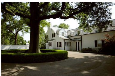
Stonereath Stud