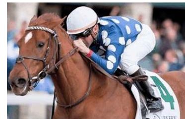
Dr. Zic