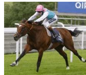
Frankel Racing Post