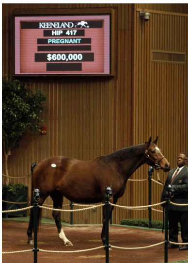
Session Topper Magnificent Honour

The Keeneland January sale continued to produce strong results across the board during yesterday's second session of the four-day auction. "It was another strong day, with increases in average and median prices and an especially big increase in gross sales," commented Keeneland's Vice President of Sales Walt Robertson. "By late this afternoon, we surpassed last year's gross for a five-day sale. The RNA rate continues to decrease, which is another strong indicator of confidence in the market. Buyers are going after quality mares and quality yearlings with equal gusto."