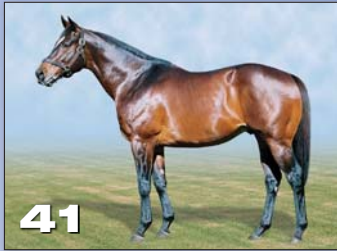
CAPTAIN AL - 41 YEARLINGS