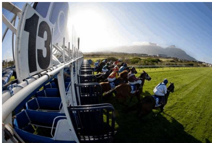
Off and running at Kenilworth...