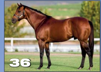
TRIPPI - 36 YEARLINGS