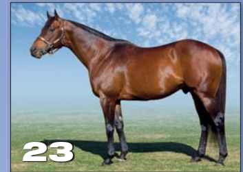
DYNASTY - 23 YEARLINGS