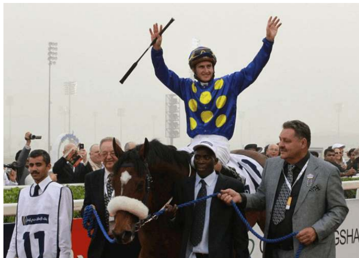
J J the Jet Plane (SAf) (Jet Master {SAf}), winner of the '10 G1 Hong Kong Sprint and '11 G2 Al Quoz Sprint