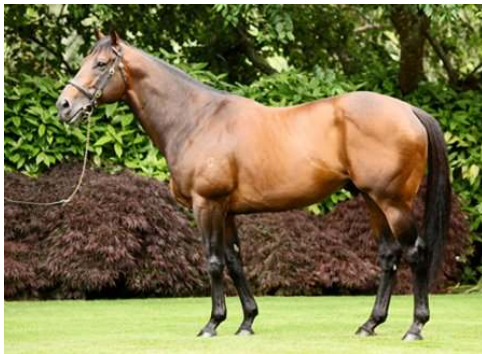
Fastnet Rock (Aus)