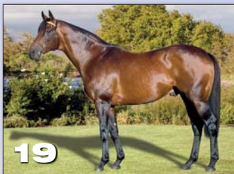
SILVANO - 19 YEARLINGS