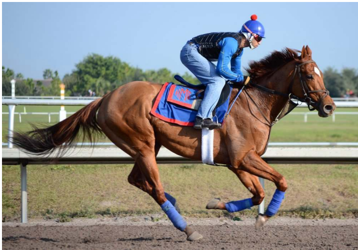
Kentucky Derby winner Animal Kingdom (Leroidesanimaux {Brz}) stretches his legs at Palm Meadows Thursday