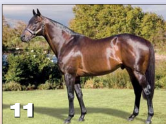
BLACK MINNALOUSHE - 11 YEARLINGS