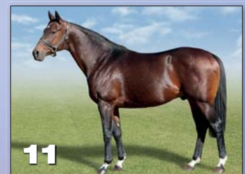
COUNT DUBOIS - 11 YEARLINGS