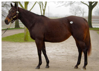
La Defense