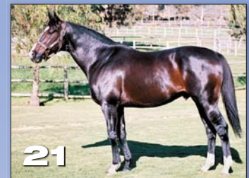
WESTERN WINTER - 21 YEARLINGS