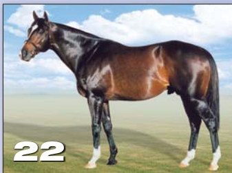
VAR - 22 YEARLINGS