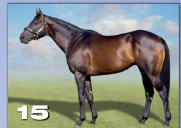
JAY PEG - 15 YEARLINGS