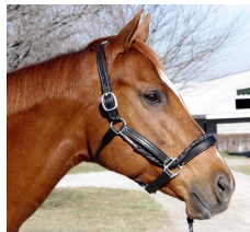
$1.4 million Topliner