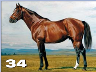
JET MASTER - 34 YEARLINGS