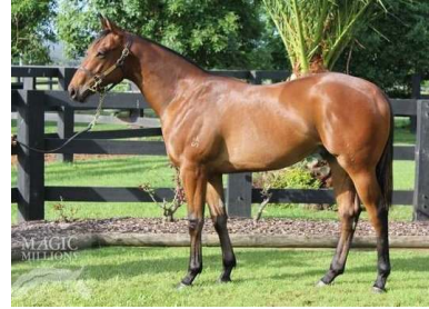
Day 2 Session Topper, Fastnet Rock (Aus) colt

Right from the start of the second session of the Magic Millions Gold Coast sale, the anticipation and the energy at the Magic Millions sales complex in Bundall Thursday was palpable, and turned out to be fully