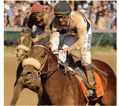
Amazombie at Churchill Downs