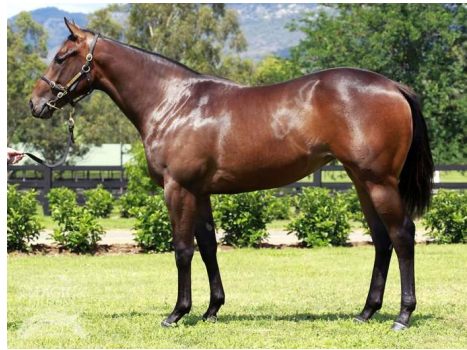
Lot 331, Shamardal filly