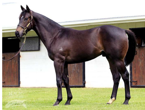
Day 3 second top colt - Lot 457

During Friday's session, the Sydney-based conditioner and the Irishman also secured lot 458 , a filly by first-