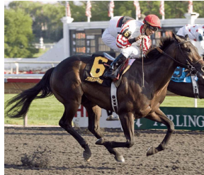
Shared Property Four Footed Fotos

The Triple Crown trail heats up in New Orleans next weekend with the GIII Lecomte S. and a handful of sophomore hopefuls tuned up in The Big Easy this past weekend. Coverage begins page 3