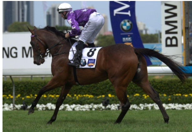
MM 2YO Classic winner Drienfontein