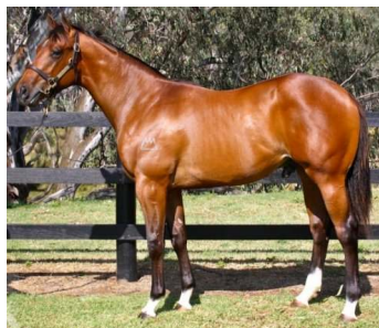
A$225,000 Bel Esprit Eliza Park