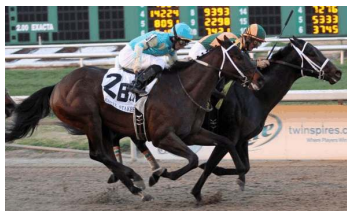
Mr. Bowling (inside) Denies Z Dager

Hugging the fence in mid-pack behind a half in :47.22, Mr. Bowling moved up and out several paths entering the far turn to take closer order. He seemed to spin his wheels briefly at the head of the lane after looming ominously, but responded to left-handed encouragement from Robby Albarado and kicked it into high gear as he sliced in between horses and to the lead. He took several strides to level off, but was traveling well inside the furlong marker and was able to contain Z Dager's resolute rally. Shared Property, who made his run farther outside than the top two, looked like a winner in mid-stretch, but ran out of real estate to fall a half-length short of the runner-up.