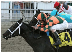
Mr. Bowling Hangs On