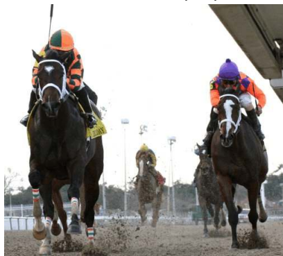
Believe You Can (left)

Believe You Can brought a two-race win streak in from Delaware Park when she contested the Oct. 2 GIII Tempted S. at Belmont Park, and she had no trouble with the step up in class there, scoring by 2 1/2 lengths. She seemed to struggle a bit with her first route test last time in Churchill's GII Pocahontas S. Oct. 30, fading in the lane to be sixth, but her connections gave her another chance to go long here with a series of upbeat drills in the interim. The homebred broke out slightly at the start, brushing with favored