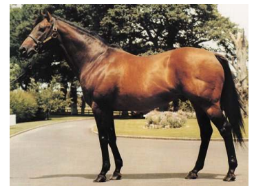
Sir Tristram