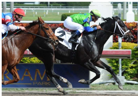
Boys At Tosconova

Boys At Tosconova, hero of the GI Three Chimneys Hopeful S. and second-place finisher in the GI Breeders' Cup Juvenile, made it three straight wins with a game tally here. Favored at 4-5, the dark bay dueled with the filly Groupie Doll from the inside through an opening quarter in :24.63. Groupie Doll edged clear through a half mile in :47.24, and had the lead in the stretch, but Boys At Tosconova's