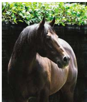
Zabeel Cambridge Stud

Sir Tristram's exploits built Cambridge into a powerhouse in New Zealand, and he left a lasting gift to the nursery: his son Zabeel (NZ), a Cambridge homebred.