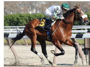
Mucho Macho Man