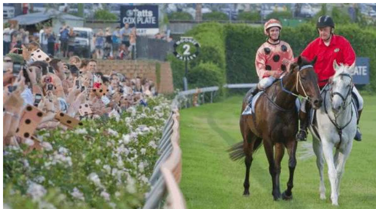
Black Caviar parades in front of her adoring fans