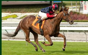
2012 dominant Santa Anita stakes winner VAMO A GALUPIAR

His 2012 Two- and Three-Year-Olds are his best-bred crops. EVER. It's going to be a BIG year.