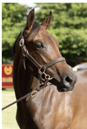
Lot 724

During a solid day's trade at yesterday's opening session of New Zealand Bloodstock's three-day Select Sale, top price of NZ$170,000 (US$141,564) was paid