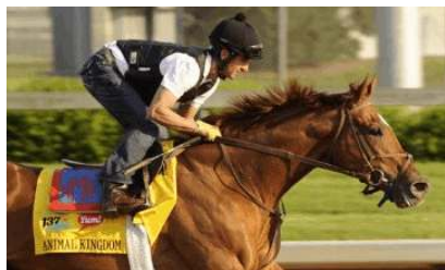
Animal Kingdom