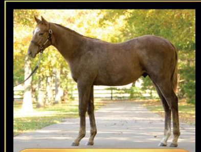
DAIJIN COLT Out of Multiple Graded Stakes Producer Daijin