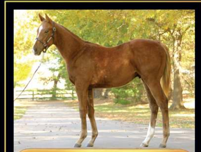
LADY TAK COLT Out of Grade 1-winning Millionaire Lady Tak

THIS IS WHAT ZENSATIONAL'S BABIES LOOK LIKE THAT WE HAVE AT THE FARM