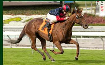
2012 dominant Santa Anita stakes winner VAMO A GALUPIAR

His 2012 Two- and Three-Year-Olds are his best-bred crops. EVER.