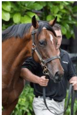
Lot 1096 nzb.co.nz

A pair of colts by top sire Pentire (GB) filled the top two spots during Friday's third and final session of New Zealand Bloodstock's Select Yearling Sale, which