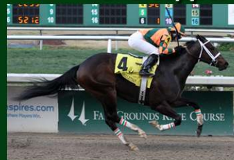
2012 Silverbulletday S. winner BELIEVE YOU CAN