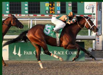
2012 Kentucky Derby contender MARK VALESKI