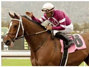
Tapizar

In addition to the Bob Lewis for 3-year-olds, Santa Anita's Saturday program features the GII Strub S. for 4-year-olds going nine furlongs and the GII Arcadia S. for turfers. Tapizar (Tapit) looks to run back to his big win in the GII San Fernando S. in the Strub, while Mr. Commons (Artie Schiller) takes on European Group 1 winner Pathfork (Distorted Humor) in the Arcadia.