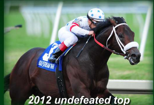
2012 undefeated top handicapper TRICKMEISTER