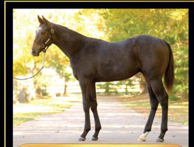
HANDPAINTED COLT Out of Grade 1 Performer / MSW Handpainted