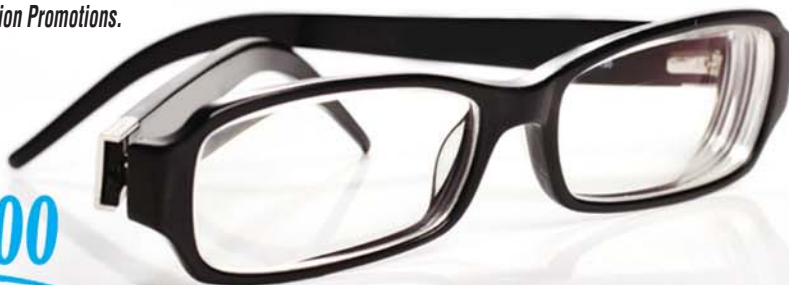
Table-topping sires from €10,000