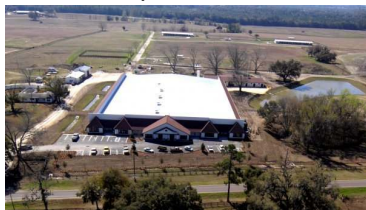
Kesmarc facility