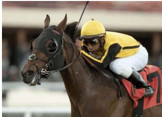
Sanagas

Sanagas (Ger) (Lomitas {GB}) makes his first start for new connections in today's GII San Marcos S. at Santa Anita, a campaign that is intended to feature an appearance in the G1 Melbourne Cup on the first Tuesday of November.