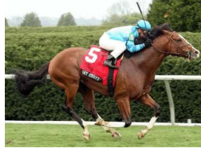
Get Stormy

Get Stormy (Stormy Atlantic) looms the one to down in today's co-featured GI Gulfstream Park Turf H. in Hallandale. Underfoot conditions should play some kind of role, as rains have pelted the region for the last couple of days.