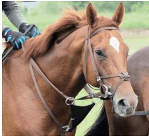
Animal Kingdom Sherackatthetrack

Team Valor International's Animal Kingdom (Leroidesanimaux {Brz}), the reigning GI Kentucky Derby winner and 3-year-old champion of 2011, will make his much anticipated return to the races in a third-level allowance on the turf at Gulfstream Park this