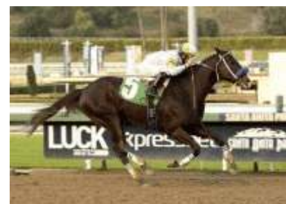
Frumious