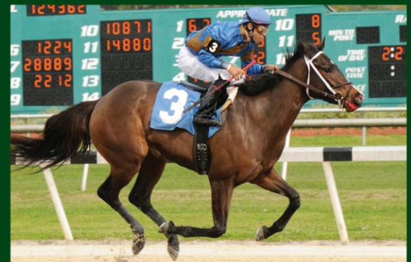
2/4 at Tampa: SILVER MARKET , stepped out for the first time to win by 1 3/4 lengths.