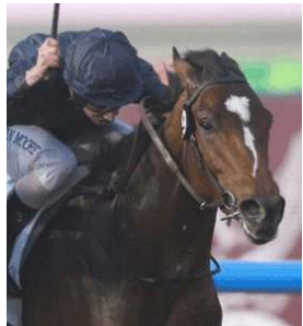
Master of Hounds