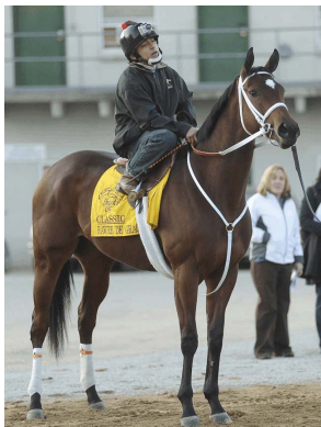
Havre de Grace

Fox Hill Farms' Havre de Grace (Saint Liam) continued to prepare for her 5-year-old debut, breezing a half-mile in :48 3/5 Wednesday morning at the Fair Grounds. The 2011 Horse of the Year was one of the first horses onto the track and broke off at the four-furlong pole,