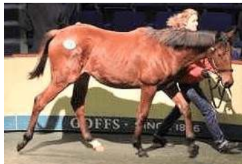
Lot 170

Despite a greatly reduced clearance rate of under 55%, session one of Goffs' two-day February Mixed Sale still registered significant advances, as six yearlings usurped last year's highest price at the auction house's Kill venue yesterday. Leading the way was Swordlestown Little's Hip 170 , a filly from the first crop of Coolmore sire and multiple Group 1 winner Mastercraftsman (Ire) (Danehill Dancer {Ire}), who was