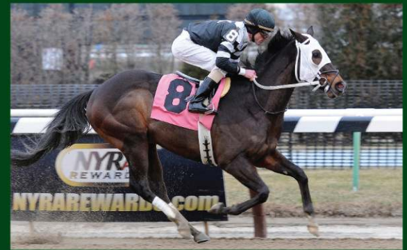
2/8 at Aqueduct: MARK IT MAN won second consecutive race by 3 lengths.