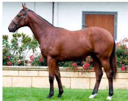
All Too Hard

Some 200 minutes before his half-sister attempts to take her career record to a perfect 19-for-19 in the G1 Coolmore Lightning S., All Too Hard (Aus) (Casino Prince {Aus}) will attempt to show his connections that he deserves a crack at next weekend's G1 Blue Diamond S. when he makes his career debut in