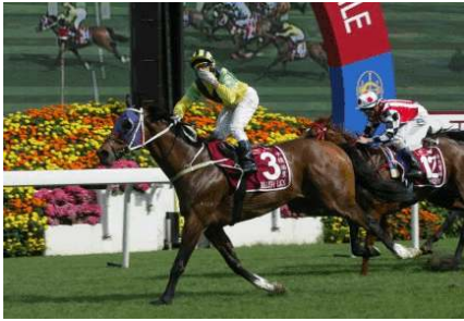
Bullish Luck

Royal Academy later stood at Ashford in Kentucky, siring the likes of Hong Kong star Bullish Luck, and shuttled to both South America and Australia. He sired nine additional Group 1 winners during his time in Brazil, and several more in Australia. Among his representatives in the Antipodes was Bel Esprit (Aus), the 2002 G1 Blue Diamond S.