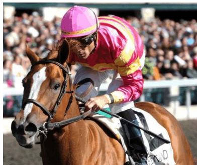
Applauding

☆ "TDN Rising Star" ☆ Applauding (Congrats), who is to be scratched from Saturday's Gill Rachel Alexandra S. at the Fair Grounds, will board a van bound for the Rood and Riddle Equine Hospital near