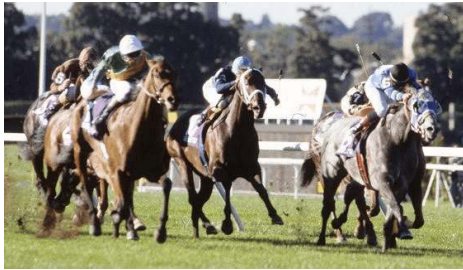
Royal Academy (white cap) winning the 1990 BC Mile