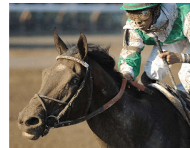
Royal Delta