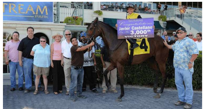
Jockey Javier Castellano after scoring his 3,000th career victory aboard West Point Thoroughbreds' Virtuously (Congrats) in yesterday's sixth race at Gulfstream