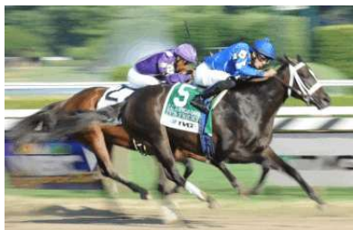
It's Tricky

Godolphin's It's Tricky (Mineshaft), unraced since her runner-up effort to champion Royal Delta (A.P. Indy) in the GI Breeders' Cup Ladies' Classic Nov. 4, will make her 4-year-old debut in the GII Top Flight S. on the