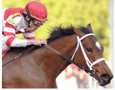
Havre de Grace