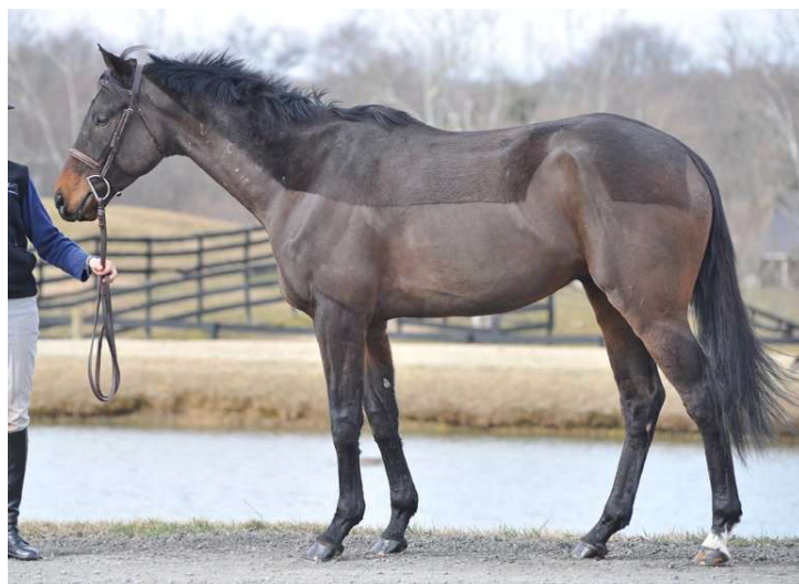
And here he is on Tuesday after a month of work