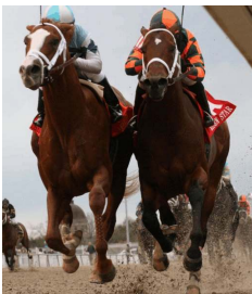
El Padrino (left)

Let's Go Stable's El Padrino (Pulpit) gave trainer Todd Pletcher his second win in the GII Risen Star S. in three years, outslugging Mark Valeski (Proud Citizen) to score by a nose. It was 5 1/2 lengths back to Z Dager (Mizzen Mast) in third. El Padrino covered the mile-and-one-sixteenth distance in 1:42.96, the fastest time since Zarb's Magic (Zarbyev) set the stakes record of 1:42.80 back in 1996. Risen Star S. cont. p3