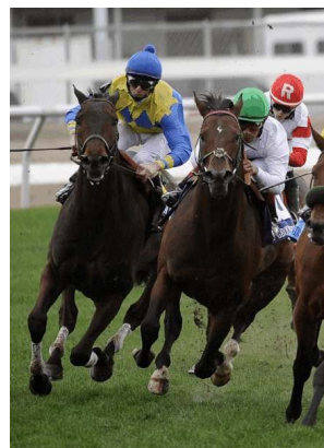
Smart Bid (green cap) sets sail for home