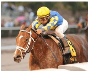
Algorithms

He's already taken down the colors of champion and GI Breeders' Cup Juvenile hero Hansen (Tapit), and Algorithms (Bernardini) gets a crack at Juvenile runner-up Union Rags (Dixie Union) in this afternoon's GII Fasig-Tipton Fountain of Youth S. at Gulfstream