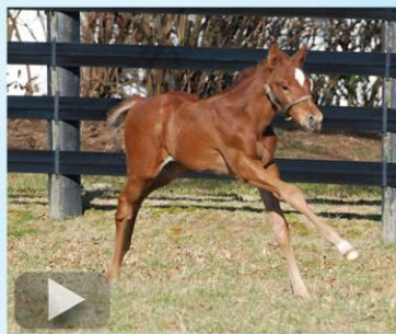
Colt out of HEART RATE , First foal out of Mr. Greeley mare