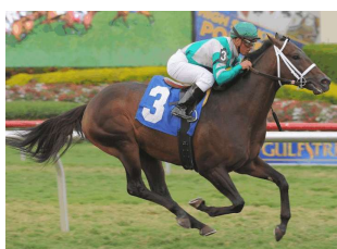
Soldat

Soldat, frontrunning victor of the GII Fasig-Tipton Fountain of Youth S., was making his first start since running 11th in last year's GI Kentucky Derby and was returning to the turf for the first time since finishing second in the 2010 GII Breeders' Cup Juvenile Turf.