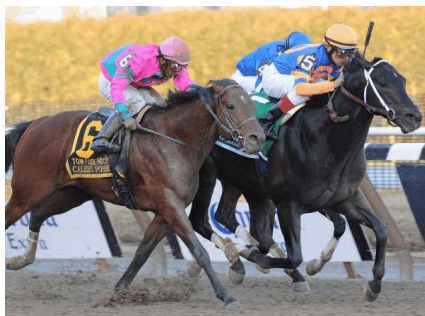
Calibrachoa center, Caleb's Posse outside, Emcee at rail