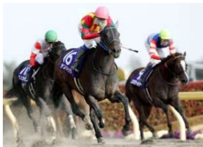
Testa Matta