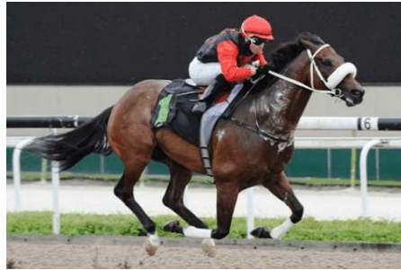
Rocket Man

Having his first run since an atypically dull 12th-place effort behind Lucky Nine (Ire) (Dubawi {Ire}) in the G1 Hong Kong Sprint Dec. 11, Rocket Man (Aus) (Viscount {Aus}) was the easy winner of a 1200-meter