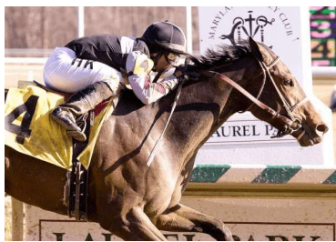
Millionreasonswhy

Sagamore Farm's Millionreasonswhy (Grand Slam), winner of last July's GII Matron S. at Belmont and a close second to eventual champion juvenile filly My Miss Aurelia (Smart Strike) in the GII Adirondack S. at Saratoga in August, returned a solid 1 1/4-length winner in Laurel's Wide Country S. Saturday, and will now look to return to the graded ranks in Aqueduct's GIII Comely S. Apr. 7. "You can never say