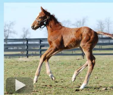
Colt out of LOTUS OF THE NILE , Half-Sister to Multiple G1 Winner PIONEEROF THE NILE

A STONESTREET Stallion | Inquiries to: Taylor Made Stallions 859.885.3345 | www.TaylorMadeStallions.com