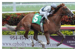
Flashy Dresser