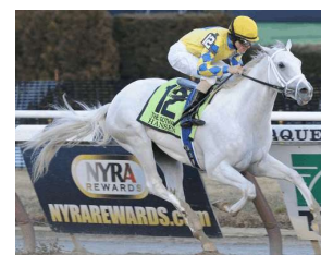
Hansen