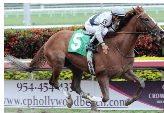
Flashy Dresser

Flashy Dresser, who worked a bullet five furlongs at Palm Meadows Feb. 18 in :59 4/5, was sent off at 7-1 in his debut. The chestnut colt chased pacesetter