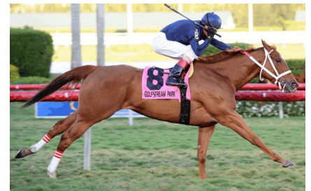
Inspired