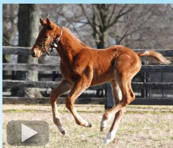
Colt out of FORTYPAULINA , G1 Winner and half to Multiple G1 Winner FANATIC BOY (ARG)