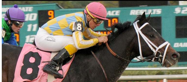
G3 winner & KY Derby hopeful Prospective