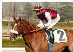
Out of Bounds