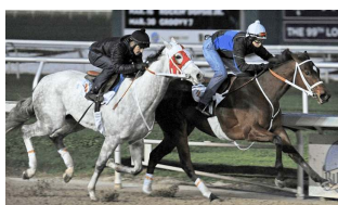
Havre de Grace (inside) and Joyful Victory