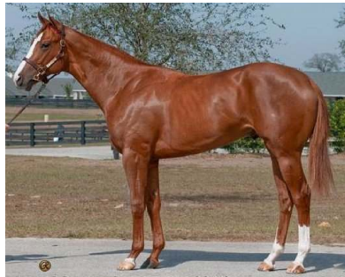
$330,000 Indygo Shiner--Coatue

Yearlings from the first North American crop of the A.P. Indy stallion Indygo Shiner were popular last year, averaging over $36,000 on a $7,500 fee. They included a trio of individuals who brought north of $150,000.