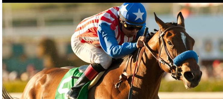
G1 winner & KY Oaks hopeful Eden's Moon