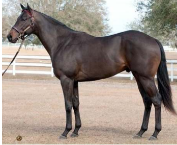
$385,000 Macho Uno--My Goodness eddiewoods.com/Louise Reinagel

A Macho Uno grandson of champion juvenile filly Caressing (Honour and Glory) brought the night's second-highest price. Catalogued as hip 126 by Eddie Woods, who enjoyed a big sale, the colt was hammered down to Danox Co. Ltd. for $385,000. The Japanese-