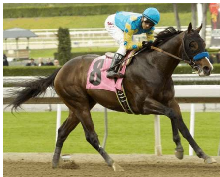
Bodemeister

Trainer Bob Baffert will tighten the girth on a pair of colts in Saturday's GII San Felipe S. at Santa Anita, but Fed Biz (Giant's Causeway) will skip the race after a minor setback. "It's nothing serious," said Baffert. "He tied up a little."