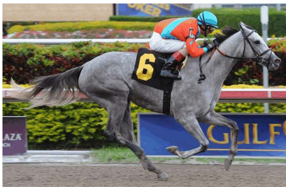
Well-bred Welcome Guest (Unbridled's Song) scores in her second start at Gulfstream.....see ATW p1

The juvenile sale season got underway Monday at Barretts, but now the action heads cross country. The under-tack show for the OBS March Sale of Selected 2-Year-Olds in Training begins today at the auction complex, with hips 1-180 set to strut their stuff from 8 a.m. onwards. Hips 181-362 are on tap for Friday. It will be streamed live on www.obssales.com .