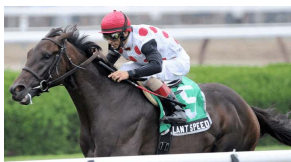
Brilliant Speed