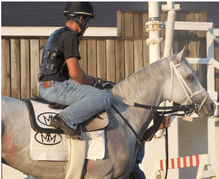
Juvenile Champion Hansen (Tapit) worked a half-mile at Churchill Downs' Trackside Training Center yesterday :50.40 in preparation for Apr. 7 GI Wood Memorial S.