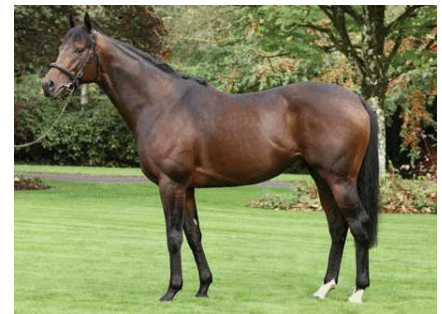
Canford Cliffs (Ire)

Coolmore champions Canford Cliffs (Ire) ( Tagula {Ire}-- Mrs Marsh {GB}, by Marju {Ire}) and Cape Blanco (Ire) ( Galileo {Ire}-- Laurel Delight {GB}, by Presidium {GB}) will shuttle from their respective Coolmore bases to the Southern Hemisphere in 2012. High-weighted sophomore in Ireland and England in 2011, Canford Cliffs --who stood the Northern Hemisphere season at Coolmore Ireland --will shuttle to Blue Gum Farm in Victoria . He will stand for A$17,500 plus GST.