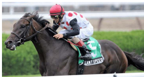
Brilliant Speed

Live Oak Plantation's Brilliant Speed (Dynaformer) will make his 2012 debut in the Mar. 31 GIII Appleton S. at Gulfstream Park. The 4-year-old, who won last year's