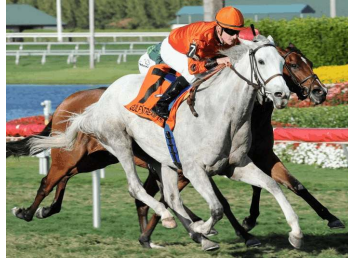
Tapitsfly A Coglianese

(Running Stag) took the field through fractions of :24.44, :47.94 and 1:11.00. The pacesetter began to tire in upper stretch and La Reine Lionne inherited the lead with Bay to Bay closing strongly, but it was the long-striding Tapitsfly who found her best gear late from the outside to hit the wire first.