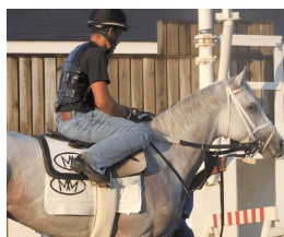
Hansen Churchill Downs

El Padrino (Pulpit), News Pending (Harlan's Holiday) and juvenile champion Hansen (Tapit) were among the Kentucky Derby hopefuls working yesterday.