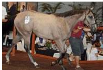
Lot 72