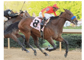
Secret Circle

The way Secret Circle (Eddington) won Saturday's GII Rebel S. at Oaklawn Park has trainer Bob Baffert eager for the Apr. 14 GI Arkansas Derby. "The win was exciting and the way he did it was promising," Baffert said Sunday. "It was a good schooling for him and I think he should get a lot out of it, although my guys tell me he was hardly blowing when he got back."