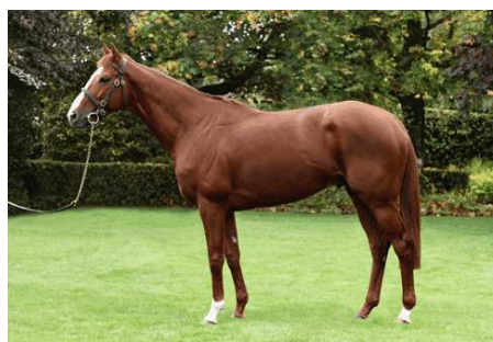
Cape Blanco (Ire) coolmore.com

"In Cape Blanco we're getting access to a five-time Group I-winning horse, who is beautifully bred as a son of the world champion sire Galileo and out of a mare [Laurel Delight], who won four races and was speedy enough to win at five furlongs [1000m] and who has been such a good producer that she was named 2010