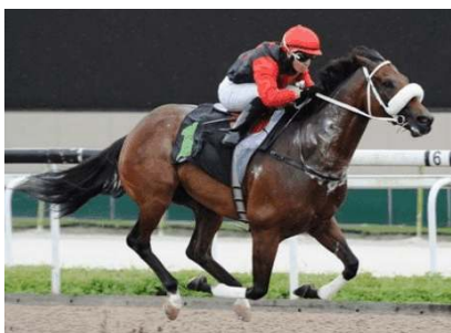
Rocket Man (Aus)

Rocket Man (Aus) (Viscount {Aus}) turned in his final local work ahead of his title defense in the G1 Dubai Golden Shaheen Mar. 31, cruising to a 3 1/4-length victory in a 1000-meter barrier trial over the Kranji all-weather track Tuesday ( video ).