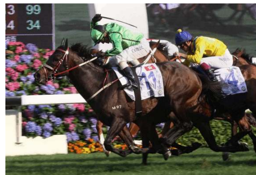
Xtension (Ire) www.turfclub.com.sg

The three rivals made their final local appearance in a Tuesday barrier trial over 1000 meters of the Sha Tin turf, a heat won by former world champion Sacred Kingdom (Aus) (Encosta de Lago {Aus}) in :59.13 ( video ). Ambitious Dragon hit the line second (:59.34) though was never asked to extend, while