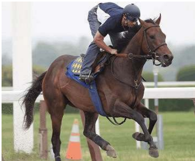
Game On Dude

With the 2012 Dubai World Cup rapidly approaching, likely candidates for the nine-race card is beginning to solidify. Take a look at the list of possible for the five Group 1 tests slated for the Mar. 31 event. Among those slated for the World Cup are Game on Dude and Royal Delta, while The Factor, Sepoy and Rocket Man are included among those looking to contest the lucrative Shaheen. Looking for someone in particular? List of probables begins on page 7