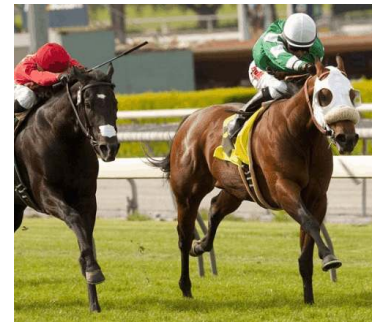
Chips All In (inside) digs in