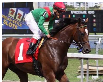
Went the Day Well

Whoever wins today's GIII Vinery Racing Spiral S. at Turfway Park, contested over nine furlongs on the Polytrack, will be registering their first graded victory. They will also be virtually guaranteed a spot in the