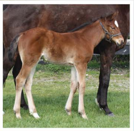
▶ Filly ex. Monevassia (Mr. Prospector), dam of European Champion 2yo filly Rumpelstiltskin