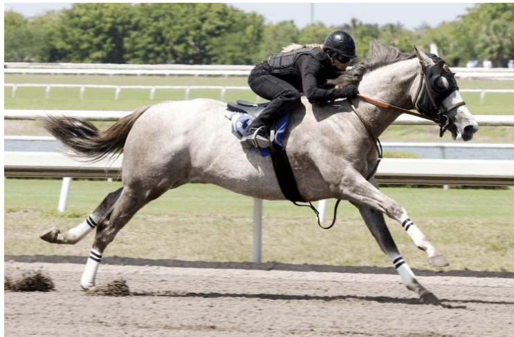
Hip 113 at work

From 8am Mar. 24, individual videos can be viewed on fasigtipton.com