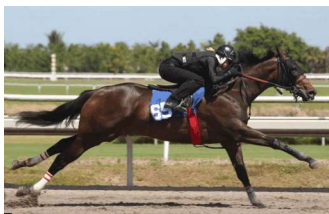
Hip 65