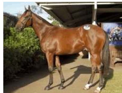
All Too Hard