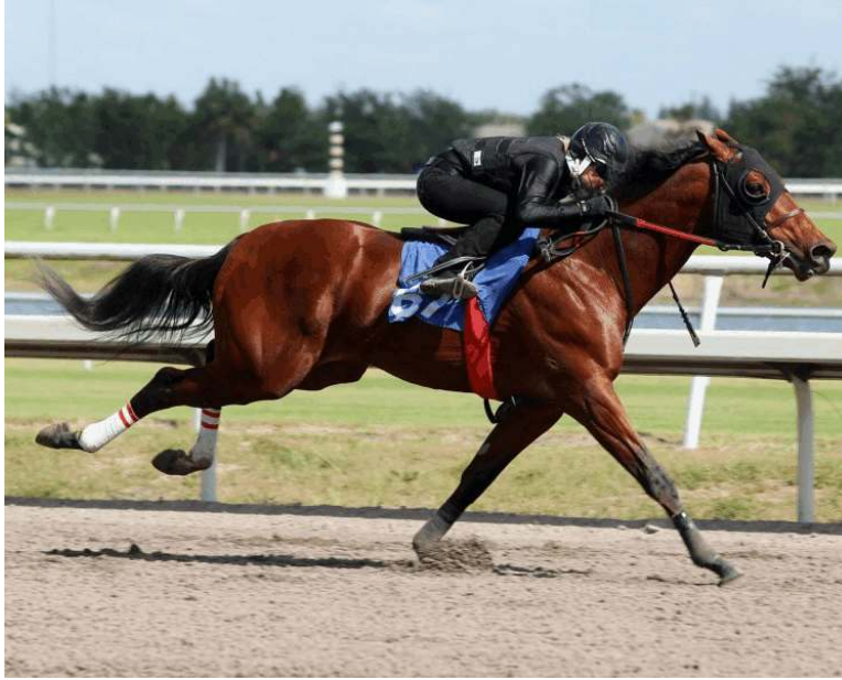
Hip 67 on his way to a co-fastest :10