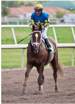
Heavy Breathing