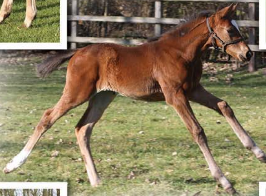
▶ Colt ex. Strictly Lambada (Red Ransom), from the Reprocolor damline, owned by Meon Valley Stud.