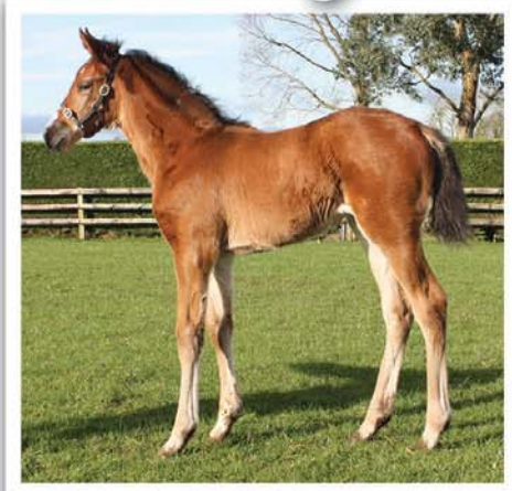
◀ Filly ex. Danehill Music (Danehill Dancer), winner of the Park Express Stakes-Gr.3.