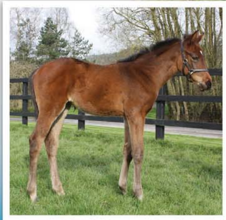
◀ Filly ex. L'Anresse (Darshaan), European Champion 3yo filly.