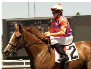
Killer Graces, heroine of the 2011 Starlet

Hollywood Park is boosting purses for its 2012 juvenile stakes program, it was announced Thursday. Purses for the GIII Hollywood Juvenile Championship and the Landaluce S. have been doubled from $100,000 to $200,000. The Cinderella S. and Willard L. Proctor Memorial S. have gone up from $70,000-added to $100,000. The GI Hollywood Starlet S., one of the highlights of the Autumn meet, has been raised from $200,000-added to $500,000 guaranteed. "These increases reward those owners and trainers