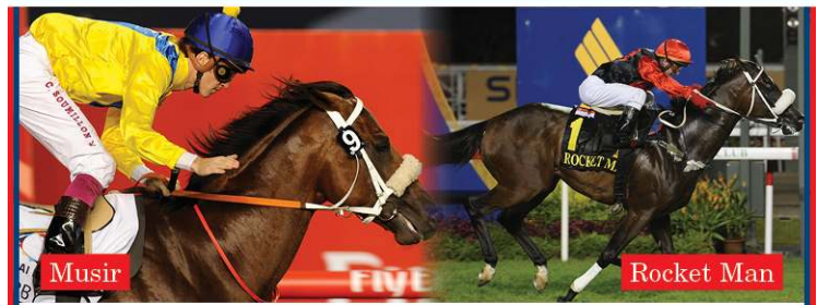
Good luck to the Aus-bred runners and their connections.