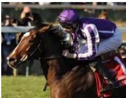
St Nicholas Abbey

"Montjeu, the highest-rated racehorse ever by the great Sadler's Wells, has died this morning at Coolmore Stud after a short illness which was due to complications from an overwhelming septicaemia," read a statement from Coolmore. "Montjeu was one of the best stallions in the world and in 2011 he sired 15 individual group/graded winners in the Northern Hemisphere, which was the equal of Galileo. Montjeu will best be remembered for his incredible wins in the Prix de l'Arc de Triomphe and King George VI and Queen Elizabeth Diamond S. as well as his runaway victories in the French and Irish Derbies."