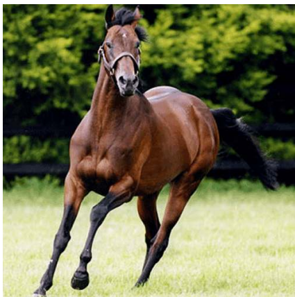
Montjeu (1996-2012) Coolmore