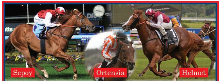
Australian-bred Thoroughbreds taking on the best at the 2012 Dubai World Cup

When Montjeu entered stud in 2001, the jury was still out as to whether the all-conquering Sadler's Wells would have a son that could approach his sire's achievements in the breeding shed. However, his first crop indicated that Montjeu would be a force to be reckoned with. Motivator, hero of the G1 Racing Post Trophy at two, added the G1 Epsom Derby in 2005. Hurricane Run (Ire) captured the G1 Irish Derby and G1 Prix de l'Arc de Triomphe that season, while Scorpion (Ire) added victories in the G1 Grand Prix de Paris and G1 St Leger S. Two years later, Authorized (Ire) also completed the Racing Post Trophy/Epsom Derby double. Fame and Glory (GB), hero of the G1 Criterium de Saint-Cloud in 2008, went on to capture the Irish Derby the following year, the G1 Coronation Cup at four, and added the G1 Gold Cup at Royal Ascot last season for good measure. St Nicholas Abbey, winner of the Racing Post Trophy in 2009, missed out on the major races as a 3-year-old, but returned at four in 2011 to secure the Coronation Cup and the Breeders' Cup Turf. French-based Pour Moi (Ire) came with a furious late rush to take Epsom honors last June in what would be his final career start, and will now attempt to take his sire's place at Coolmore. Montjeu was represented by another Racing Post Trophy winner last season in Camelot (Ire), and that colt is the current favorite for the June Classic at Epsom.