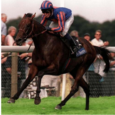
Montjeu and Kinane take the King George and Queen Elizabeth Diamond S.

Bred by the Late Sir James Goldsmith, Montjeu--who was named after the family's chateau--started out in September 1998 with an easy win at Chantilly before toying with the subsequent G1 Criterium de Saint-Cloud