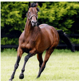
Montjeu (1996-2012) Coolmore