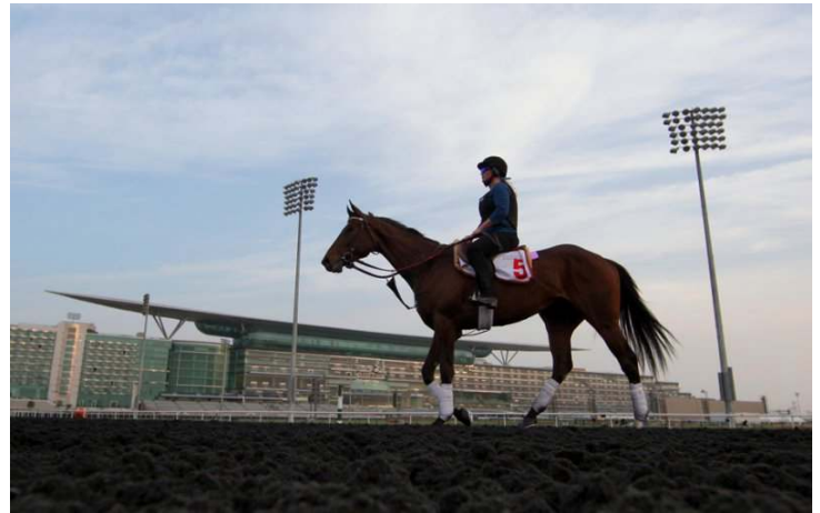
Dubai World Cup Contender Royal Delta at Meydan Horsephotos