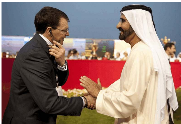
Sheikh Mohammed congratulates trainer Aidan O'Brien following the G2 UAE Derby

Margins: 1 1/4, 3/4, 1 1/4. Also Ran: Mickdaam (Ire), Red Duke, Balada Sale (Arg), Lucky Chappy (Ire), Burano (Ire), Kinglet, Falls of Lora (Ire), Maritimer, Helmet (Aus), Entifaadha (GB), Genten. Scratched: Counterglow (Ire), Mehdi (Ire), Surfer. Click for the Racing Post chart, the brisnet.com PPs or the free brisnet.com catalogue-style pedigree. Video, courtesy Emirates Racing