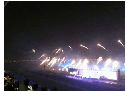
The 'opening' ceremony at Meydan

Having decided to stay upstairs for the G3 Dubai City of Gold, I had my binoculars trained on the field and watched as poor Fox Hunt (Ire) went down in the early stages. The outriders should be given major credit for getting the field waved off as they entered the backstretch when it became obvious that they would not be able to avoid the stricken runner.