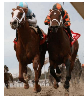
Mark Valeski (right) just misses in the Risen Star