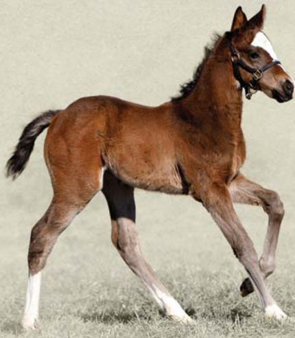
Out of Seventh Veil at Machmer Hall