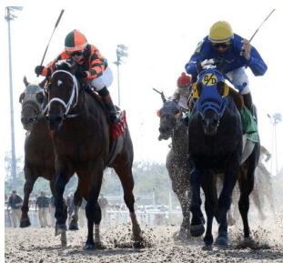
Hero of Order (gold cap) holds off Mark Valeski