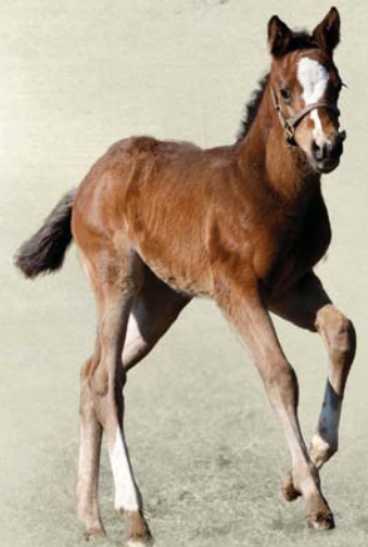
Out of I'm Beguiled Again at Corner Woods Farm

Tale of the Cat - Silence Beauty (Jpn), by Sunday Silence | $15,000 S&N