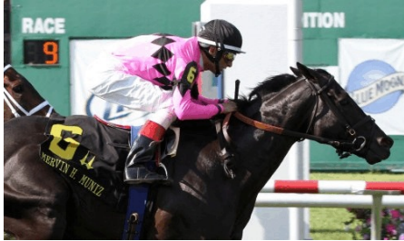
Casino Host