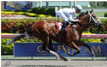
Gemologist

The Derby-related action wasn't limited to New Orleans. A trio of runners, including expected favorite Gemologist (Tiznow), got in their final works ahead of next Saturday's GI Resorts World New York Casino Wood Memorial S. at the Big A. We also check in with horses exiting Saturday's GI Florida Derby, and find out where super impressive 'TDN Rising Star' Bourbon Courage (Lion Heart) will appear next.