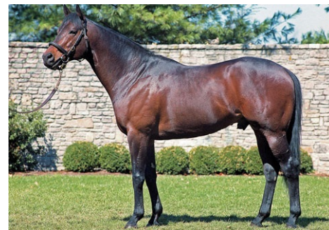
Grand Slam (1995-2012)