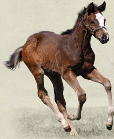
Out of Ellie's Moment at Darby Dan Farm