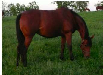
Take the Ribbon...