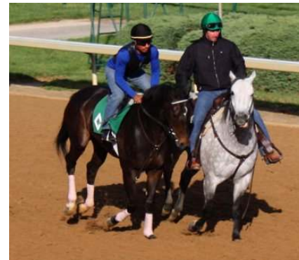
Devil By Design on the track