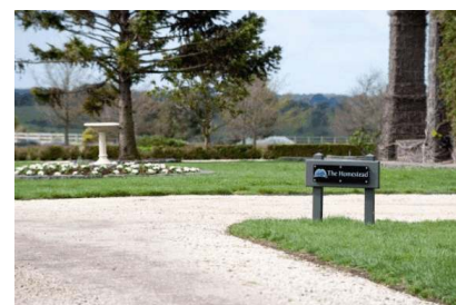
On the farm at Makybe