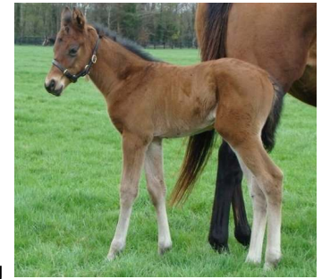
...and her '12 Medaglia d'Oro Coolmore photos