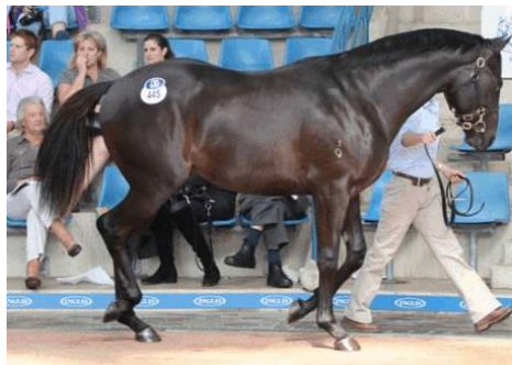
Lot 445