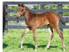
I'M FROM DIXIE filly 3/3 Out of a 1/2 to Four SWs