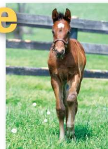
KIVI colt 3/20 1/2 to G1 SW & Breeders' Cup winner REGALLY READY