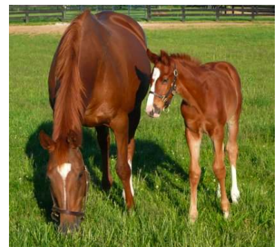
Marozia, with Bocelli as a foal

All post times in the TDN are local time