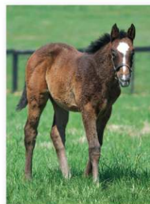
SILVICULTURE filly 2/15 Out of 1/2 to Two GSWs

Arch - Liable, by Seeking the Gold $35,000 LFSN