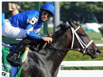
It’s Tricky

Godolphin’s It’s Tricky (Mineshaft) cuts back in distance to seven furlongs for today’s GII Distaff H. at the Big A. Last term’s GI Breeders’ Cup Ladies’ Classic runner-up kicked off her 4-year-old campaign with a win in the 1 1/16-mile GII Top Flight H. over the inner surface Mar. 3. She defeated Turbulent Descent (Congrats) going a one-turn mile in Belmont’s GI Acorn S. last June. “The seven-eighths is a turn back from the 1