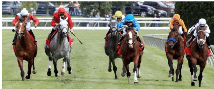
Data Link (outside) takes Maker's 46