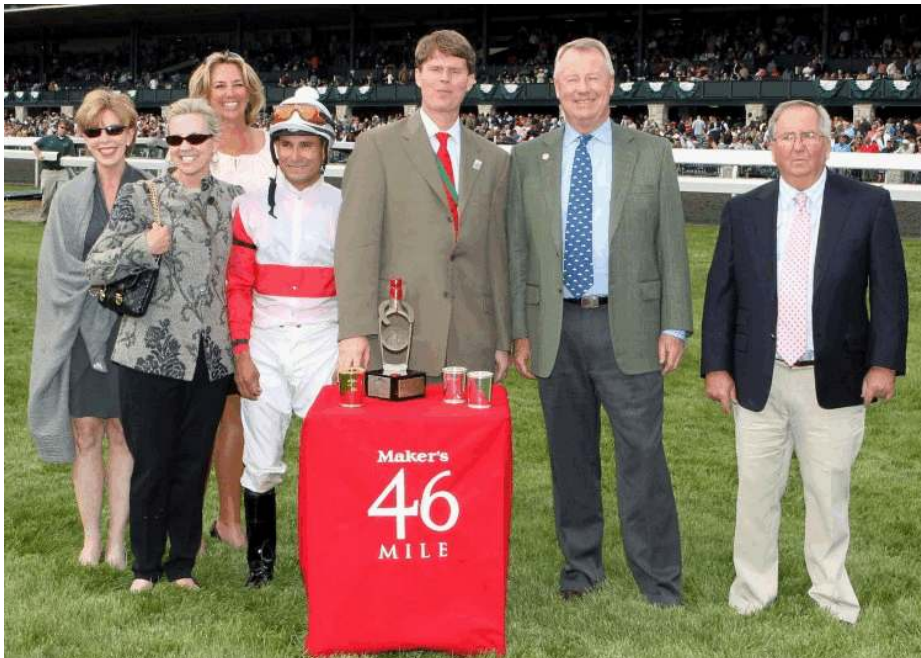
All smiles in the GI Maker's 46 Mile winner's circle at Keeneland