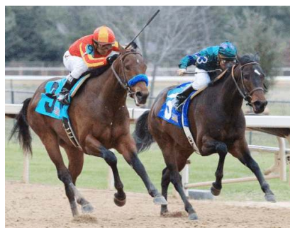
Scatman (rail) in the Southwest

Quick, who has the highest lifetime Beyer Speed Figure in the Blue Grass field? You might have guessed