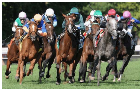
Zagora (second from left) and Aruna (white cap)

The Jenny Wiley was boosted to Grade I status for this year, and has drawn a talented group of six. Zagora