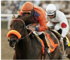
Uh Oh Bango

If you put up the money, they will come. With a $1-million purse for the second straight year, the GII Charles Town Classic has pulled together runners from all parts of the country, though perhaps not the division's first string. The Arizona-bred Uh Oh Bango (Top Hit) is in career form. After capturing the GII San Pasqual H. at Santa Anita Jan. 7, the dark bay was second to Game On Dude (Awesome Again) in the GII San Antonio S. Feb. 5, and most recently rallied to be third in the GI Santa Anita H. Mar. 3. "I think he finally figured out