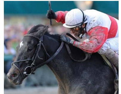
Hymn Book