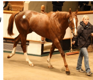
Lot 138 - Shamardal colt