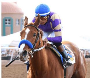
Princess Arabella Coady

Peachtree Stable's undefeated TDN Rising Star Princess Arabella (Any Given Saturday) has been retired due to a soft-tissue injury. An eight-length winner of the Sunland Park Oaks last time Mar. 25, the sophomore filly was one of the favorites for the May 4 GI Kentucky Oaks. "She came back with a soft-tissue problem and was going to need six or seven months off," explained trainer Bob Baffert on HRTV Thursday. "So we decided, in her best interest, to retire her and send her back to Kentucky [to be bred]. It's such a shame