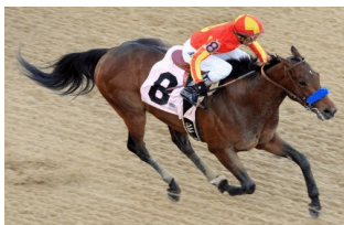
Secret Circle