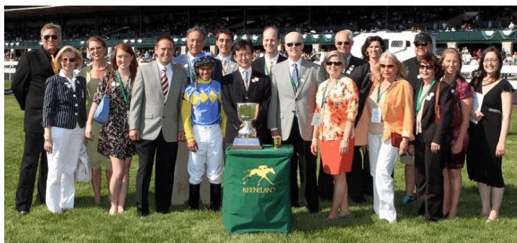
The Appalachian Trophy Presentation