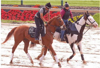
I'll Have Another