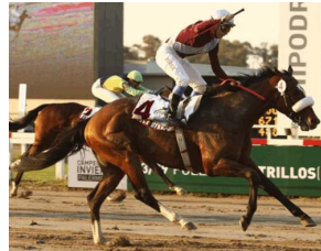
Turf Diario/Marcelo Sarachi