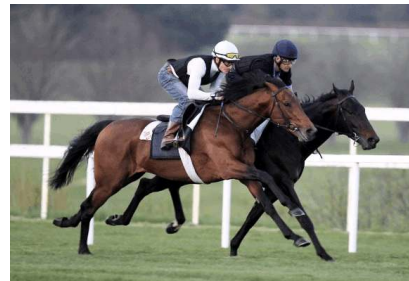
Born to Sea (near)