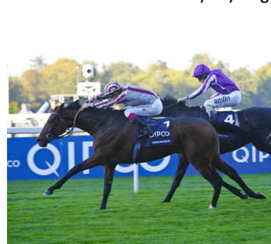
Cirrus des Aigles