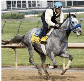
Creative Cause