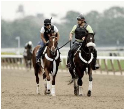
I'll Have Another takes his first turn around Belmont

GI Kentucky Derby and GI Preakness S. hero I'll Have Another (Flower Alley) returned to the track for the first time since his victorious effort at Old Hilltop last Saturday, taking one lap around Belmont's 1 1/2-mile main track Wednesday morning. And by all accounts,