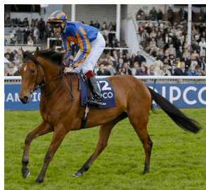
Maybe