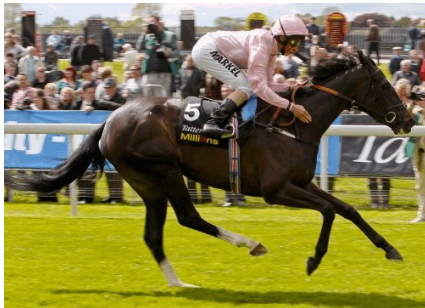
The Fugue