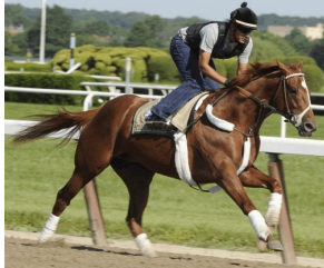
I'll Have Another