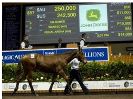
Day 2 Topper Magic Millions

A colt by first season sire Wanted (Aus) (Fastnet Rock {Aus}) topped Thursday's second session of the