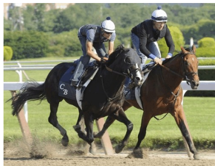
Street Life (outside)

☆ Street Life (Street Sense) to a sharp four-furlong drill a week ago at Belmont, and yesterday added a solid