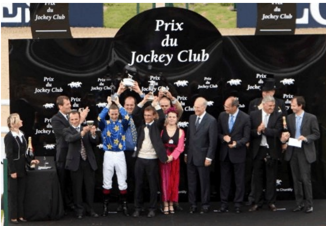
The winning connections