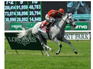
Tapitsfly