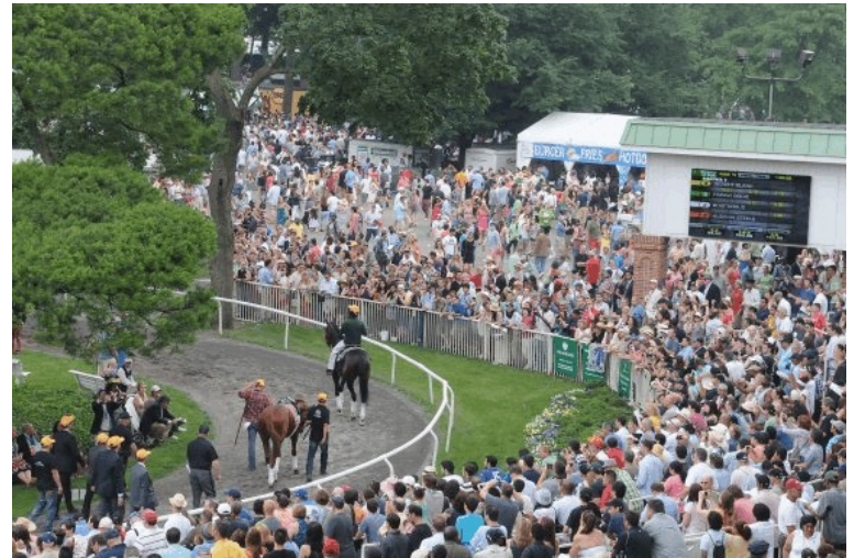
Belmont faithful say goodbye to I'll Have Another, being led by Lava Man