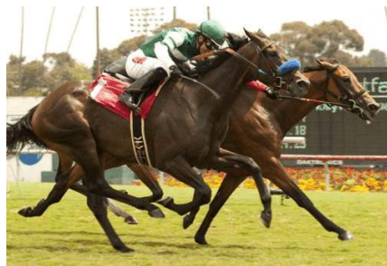
My Gi Gi (rail) holds off Lady of Shamrock