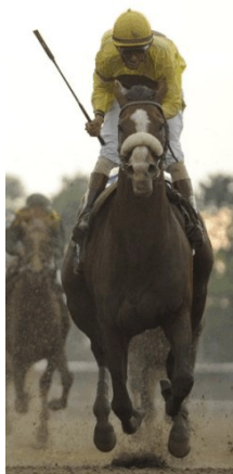
Union Rags