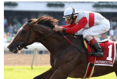
Data Link