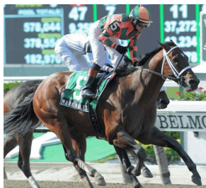
Mark Valeski

Mark Valeski missed by just a nose to El Padrino (Pulpit) when second in the Feb. 25 GII Risen Star S. and was runner-up again in the Apr. 1 GII Louisiana Derby. He was taken out of consideration for the May 5 GI Kentucky Derby just days before the race and re-routed to the Peter Pan, where he secured a 1 1/4-length victory. On the board in five of six starts to date, Mark Valeski has won three times and earned $430,952.