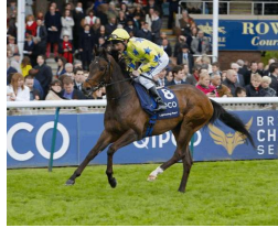
Lightening Pearl

Pearl Bloodstock's Lightening Pearl (Ire) (Marju {Ire}) may not have seen out the one-mile distance of the G1 English 1000 Guineas last time out, but cuts back to six furlongs for this evening's G3 Ballyogan S. at Leopardstown, the same trip at which she sparkled in landing last year's G1 Cheveley Park S.