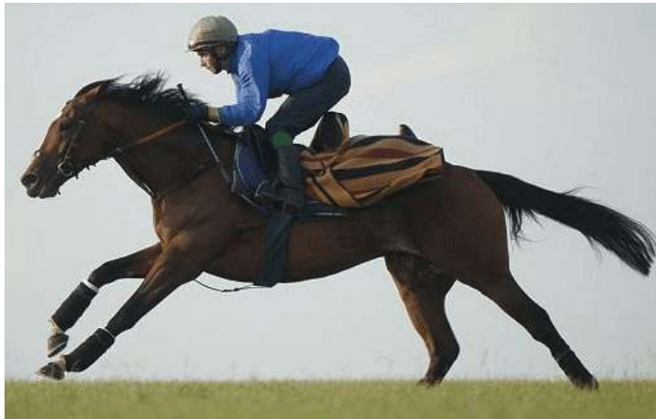
Frankel on the gallops