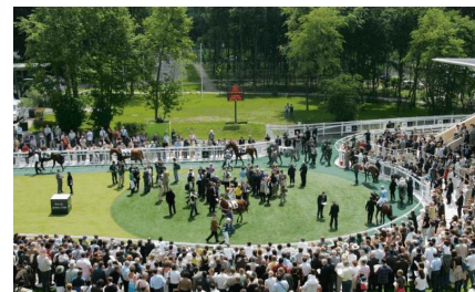
The paddock at Chantilly