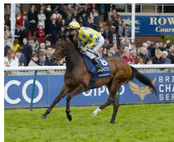
Lightening Pearl

Today's G3 Ballyogan S. at Leopardstown sees the return of Lightening Pearl (Ire) (Marju {Ire}), who proved a disappointment when down the field in the G1 1000