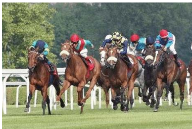
Angegreen (2nd from left)