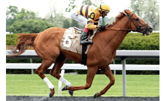
Wise Dan