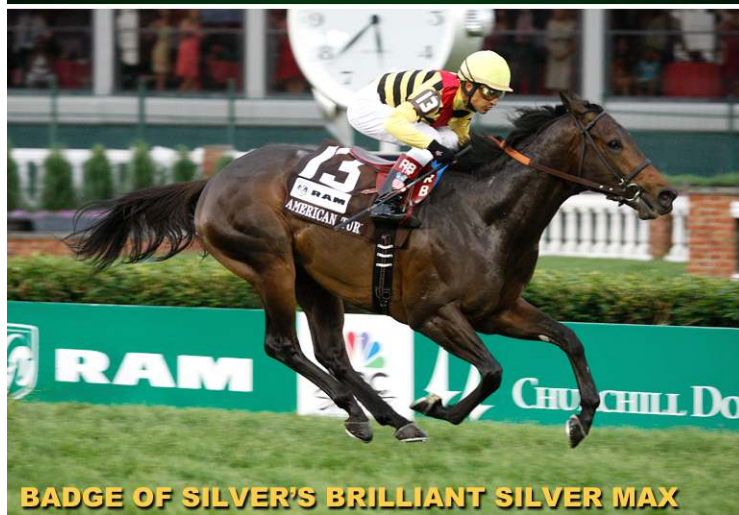
BADGE OF SILVER'S BRILLIANT SILVER MAX

“He is one of the best I've ever trained.”