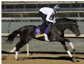
Royal Delta

Royal Delta (Empire Maker) returns to the scene of her victory in the GI Breeders' Cup Ladies' Classic for the GII Fleur de Lis H. tonight at Churchill Downs. She'll square off with St. John's River (Include), runner-up in the 2011 GI Kentucky Oaks.