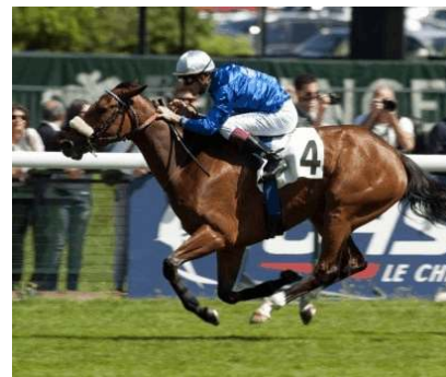
Beauty Parlour

Beauty Parlour (GB) (Deep Impact {Jpn}) will face just 11 rivals as she bids to complete the G1 Poule d'Essai des Pouliches-G1 Prix de Diane double at Chantilly tomorrow. Keeping her unbeaten record intact in the May 13 Longchamp mile contest when last seen, Ecurie Wildenstein's "TDN Rising Star" has received a wide draw in nine as she bids to emulate the recent dual Classic heroines