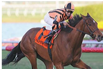
Little Mike

Plus check out fields for all of Saturday's stakes action across the country.