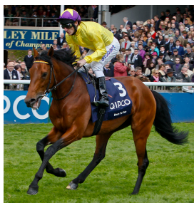
Born To Sea