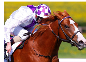
Dawn Approach