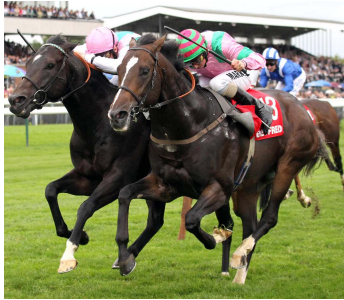
Dream Ahead just edges Bated Breath

Bated Breath (GB) (Dansili {GB}), narrowly beaten by Dream Ahead (GB) (Diktat {GB}) in last year's G1 July Cup, will look to improve a spot in this year's renewal of the race July 14 at Newmarket.