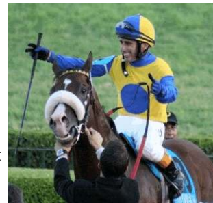
Expressive Halo

(US$243,000) G1 Gran Premio Estrellas Classic. A field of eight has assembled for the 2000-meter race, with Expressive Halo (Arg) (Halo Sunshine), winner of the G1 GP Carlos Pellegrini in December and the