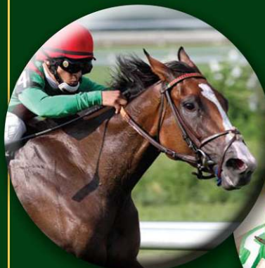
2011 G1 Winner SUMMER SOIREE