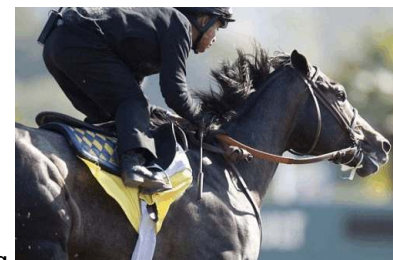
The Factor