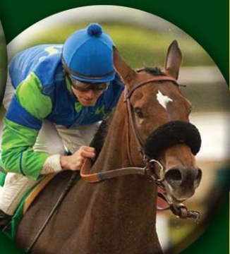
2012 G1 Winner INCLUDE ME OUT

TWO Grade 1 winners over the last two years got their start in Barn 3 at the Fasig-Tipton July Sale. Find your next star at the Brereton C. Jones consignment this year.