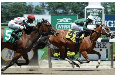
Baby J at Belmont