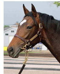
Hip 110: Neo Universe filly