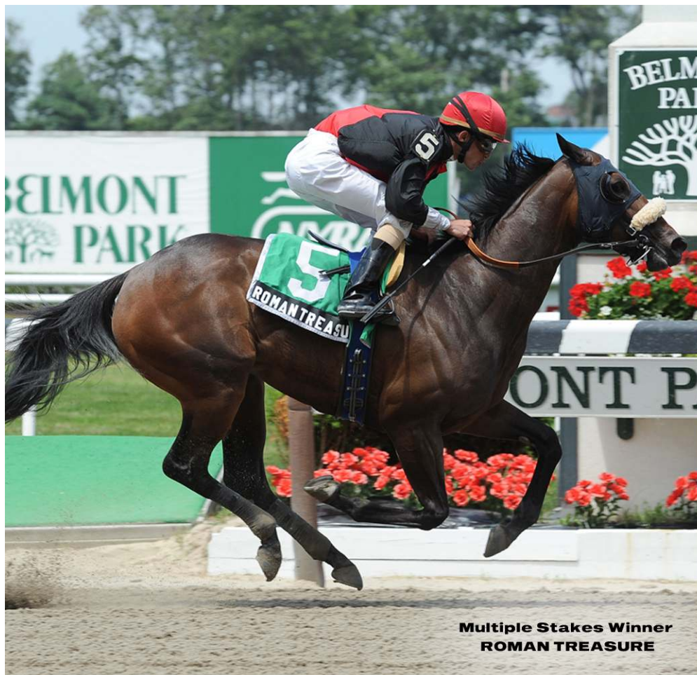
Multiple Stakes Winner ROMAN TREASURE

For complete results, go to: http://www.jrha.or.jp/eng/index.html