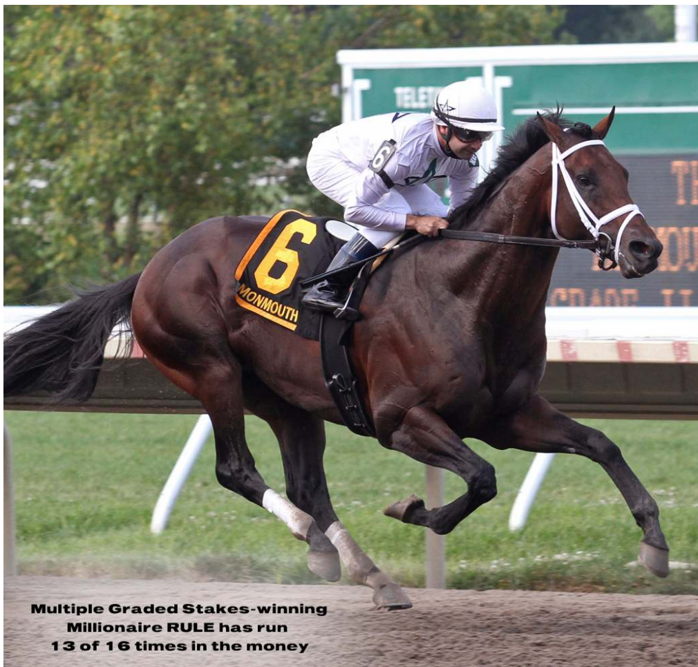
Multiple Graded Stakes-winning Millionaire RULE has run 13 of 16 times in the money

Red Desire earned international acclaim when she defeated eventual G1 Dubai World Cup winner Gloria de Campeao (Brz) (Impression {Arg}) in the G2 Al Maktoum Challenge Round III in Dubai and finished third in the GI Flower Bowl Invitational S. at Belmont Park. She and the yearling colt are from the family of GI Arlington Million winner Debussy (Ire) (Diesis {GB}) and English Group 1 winner and sire Belmez (El Gran Senor).