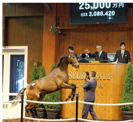
Hip 51: Sale-topping Deep Impact colt

Propelled skyward by phenomenal young sire Deep Impact (Jpn) (Sunday Silence) and enthusiastic new buyers, the Japan Racing Horse Association Select Sale achieved record turnover of ¥5,452,600,000 (about $67,316,049) (US$1 = 79.6¥) for its yearling session Monday. With 202 yearlings selling from a record 242