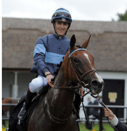
Giofra

Plagued with a leg injury on the eve of her intended racecourse introduction, Giofra was eventually unleashed in a small event at Moulins last September and was an unpromising fifth in that before winning a mile maiden at Compiègne and Longchamp's Listed Prix Casimir Delamarre over nine furlongs the following month. Returning to put her then stable companion Vadamar (Fr) (Dalakhani {Ire}) to the sword in the 10-furlong G2 Prix d'Harcourt back at the latter venue Apr. 8, she made no impact on Cirrus des Aigles (Fr) (Even Top {Ire}) when a clear second in the Prix Ganay three weeks later. Positioned near to the steady early tempo set by Lay Time (GB) (Galileo {Ire}), she allowed Elusive Kate first run and for a while, it looked as if Frankie Dettori had stolen the show on that returning G1 Prix Marcel Boussac heroine.