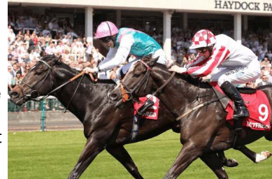
Bated Breath (left)