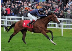
Imperial Monarch

★ "TDN Rising Star" ★ Imperial Monarch (Ire) (Galileo {Ire}) is currently the understudy to Camelot (GB) (Montjeu {Ire}) at Ballydoyle and, after making way for his star stable companion in the G1 Irish Derby, has a crack at the big time in today's G1 Juddmonte Grand Prix de Paris. Unlucky when one of the worst victims of the traffic issues in the G1 Prix du Jockey Club at Chantilly last time June 3, the Apr. 28 G3 Sandown