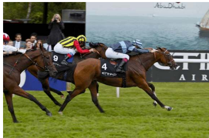
Giofra