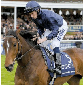
Homecoming Queen

This year's G1 1000 Guineas winner Homecoming Queen (Ire) (Holy Roman Emperor {Ire}--Lagrion, by Diesis {GB}) has been retired, Aidan O'Brien announced yesterday. Successful by nine lengths in the Newmarket mile Classic in May, the 3/4-sister to Dylan Thomas (Ire) had failed to hit the board subsequently in the G1 Irish 1000 Guineas and G1 Coronation S. and