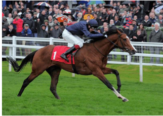
Imperial Monarch

Ballydoyle representative and ‘TDN Rising Star’ Imperial Monarch (Ire) (Galileo {Ire}) escapes the shadow of stable companion Camelot (GB) (Montjeu {Ire}) today as he seeks Group 1 glory of his own in Longchamp’s Juddmonte Grand Prix de Paris.