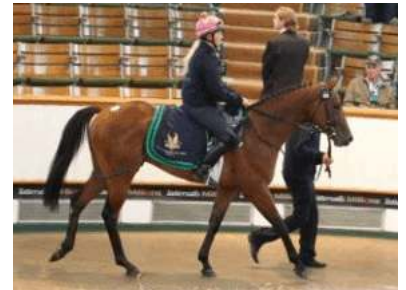
Peter Anders