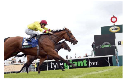
Gracia Directa Grossick Racing

Breaking well to race prominently alongside last year's G1 Nunthorpe S. winner Margot Did (Ire) (Exceed and Excel {Aus}), the bay gained the edge with a quarter mile remaining and, despite the attentions of Hallelujah and Sioux Rising, held on for the all-important pattern win. Connections will now point at the G3 Oak Tree S. at Goodwood Aug. 3.