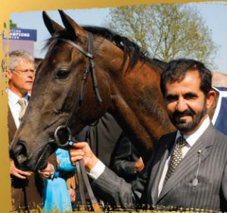
Dual European Classic winner Blue Bunting with Sheikh Mohammed