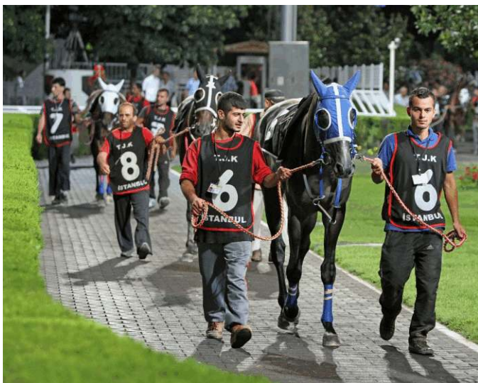
Veliefendi paddock

Dozens of conference delegates seized the chance to observe racing, Turkish style, during a special evening program at Veliefendi Racecourse on July 18. Conference leaders presented a trophy to the connections of Torok (Ire) (Singspiel {Ire}), a 3-year-old colt who won the $35,935 Asian Racing Conference S. over 2000 meters on Polytrack.