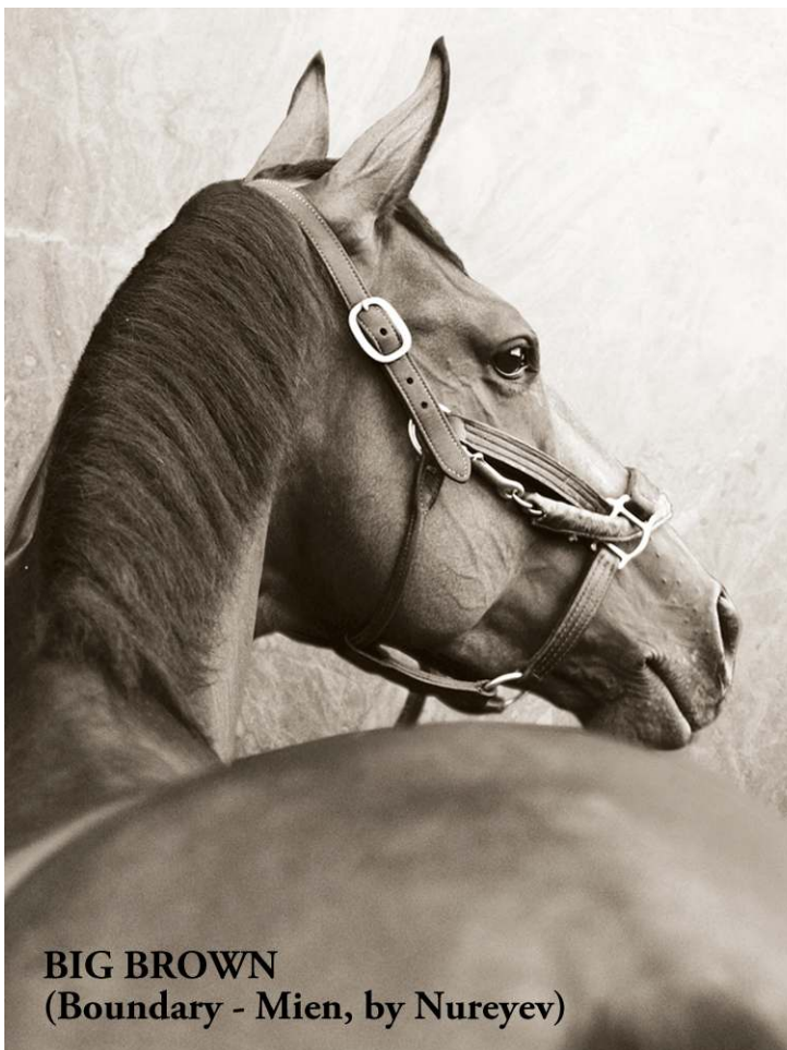
BIG BROWN (Boundary - Mien, by Nureyev)

twinspires.com THE BEST ONLINE WAGERING EXPERIENCE IN RACING.