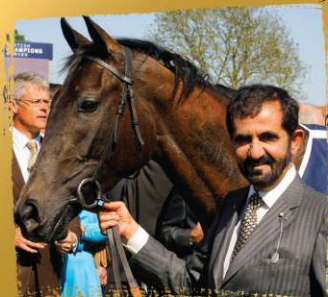
Dual European Classic winner Blue Bunting with Sheikh Mohammed