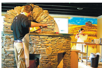
Harvest & Hearth's pizza oven

251-B County Route 67 Saratoga Springs, NY 12866 www.harvestandhearth.com