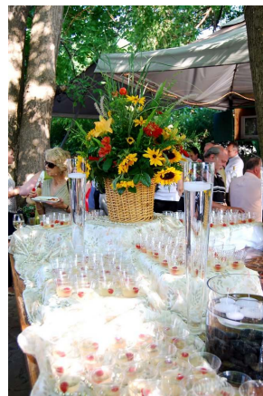
Sperry's outdoor bar

Want to send a "Letter to the Editor" of the Thoroughbred Daily News ? Our address is 60 Broad St., Red Bank, NJ, 07701; or send a fax to: (732) 747-8955; an e-mail to: editor@thoroughbreddailynews.com ; or post in our new Forum section at http://www.thoroughbreddailynews.com/members/forum/ .