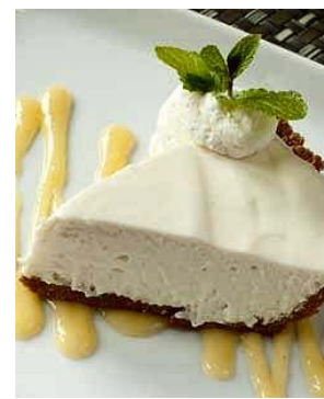
Saratoga Cheesecake from Maestro's

"Maestro's, which many of you will remember in its longtime spot on Broadway, has moved to the Van Dam Hotel, the largest surviving pre-Civil War hotel in Saratoga. The space is gigantic--it has a huge bar and lounge and a big, open dining room that is beautifully done and the whole front porch of the Van Dam is now outdoor seating, which is really nice. It has a very unique menu, with absolutely something for everybody. Everything about