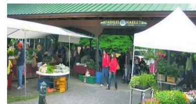
Saratoga Farmer's Market

Saratoga Springs Farmer's Market High Rock Park Pavilions High Rock Avenue Saratoga Springs, NY