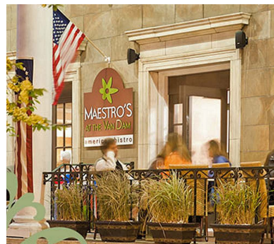
Maestro's at the Van Dam Hotel