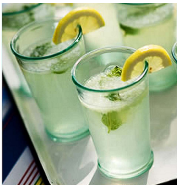
Hattie's Front Porch Lemonade

"I avoid fried chicken 10 1/2 months of the year just so I can make several guilt-free trips to Hattie's Restaurant during the Saratoga meet. Hattie's isn't trendy, although in tradition-rich Saratoga Springs a 74-year-old restaurant can automatically qualify as such. And it isn't