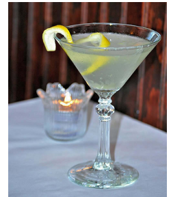
Cocktail from Sperry's

30 1/2 Caroline Street Saratoga Springs, NY 12866 (518) 584-9618 www.sperrysrestaurant.com