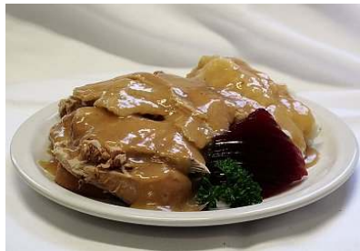
Roast Turkey Dinner at Winslow's