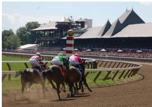
Heading for home at the Spa...

Fresh off the heels of a record-breaking opening-day crowd of 47,339 at Del Mar Wednesday, the summer action shifts to upstate New York for Saratoga's 144th season with a loaded 10-race card headed by a pair of graded stakes. An evenly matched septet of 2-year-old fillies will take centerstage in the GIII Schuylerville S.