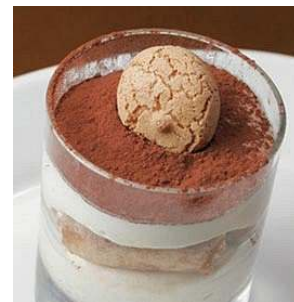
Tiramisu from Chianti II Ristorante

28 Tables 17 Maple Ave Saratoga Springs, NY (518) 226-0126 www.28tables.com