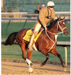
Havre de Grace