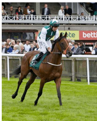
Maureen

Hard-luck stories have always been part and parcel of the racing game, and Maureen (Ire) (Holy Roman Emperor {Ire}) is the latest looking to turn fortunes around in today's G3 Princess Margaret S. at Ascot. Widely considered the best filly to come out of the