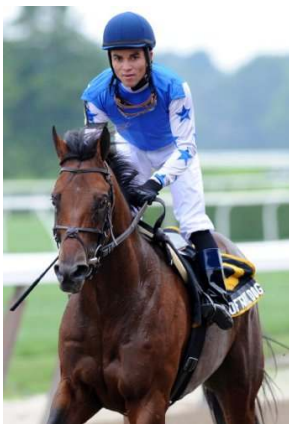
Teeth of the Dog