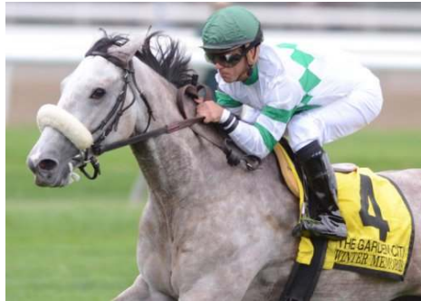
Winter Memories