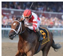
Havre de Grace