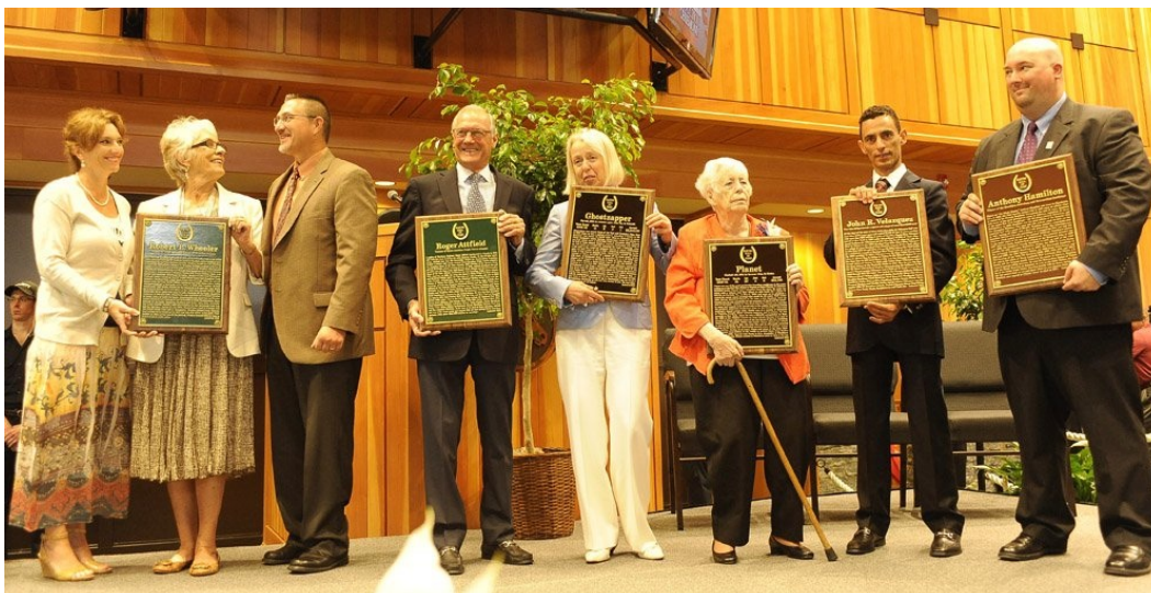
The 2012 Hall of Fame inductees