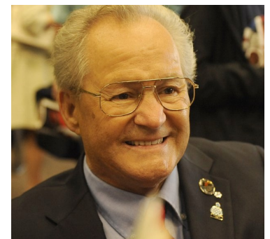
Hall of Fame jockey Ron Turcotte