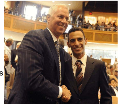
Todd Pletcher & John Velazquez

Racing fans packed the Humphrey S. Finney Pavilion in Saratoga Springs Friday morning to welcome the class of 2012 inductees into the National Thoroughbred Racing Hall of Fame. The ceremony got underway with the introduction of previously inducted Hall of Famers, including jockeys Jerry Bailey, Chris McCarron, Ron Turcotte, Randy Romero, Kent Desormeaux, Edgar Prado and Jose Santos, as well as trainers Nick Zito, Carl Nafzger, D. Wayne Lukas, Shug McGaughey and Bill Mott. The loudest cheers came for returning Hall of Famers Angel Cordero and Allen Jerkens--whose introduction from emcee Tom Durkin revealed "he hates to be called the Giant Killer, so we won't mention that."