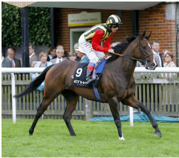
Elusive Kate

Trainer Andre Fabre's quest for a sixth renewal of Deauville's G1 Prix du Haras de Fresnay-le-Buffard - Jacques le Marois remains in doubt, despite his sole contender Golden Lilac (Ire) (Galileo {Ire}) yesterday featuring among 11 declarations for the €600,000 contest. With Golden Lilac set to exit the 10 hole, Fabre waited before giving late approval for Gestut Ammerland's dual Classic heroine and "TDN Rising Star" to