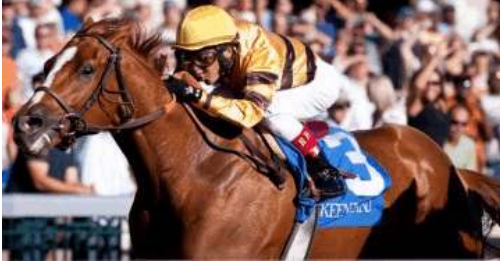
Wise Dan

Looking to get back into winning form following a narrow defeat by Ron the Greek (Full Mandate) in the GI Stephen Foster last time, Wise Dan (Wiseman's Ferry) heads a competitive field in Saturday's GII Fourstardave H. at Saratoga.