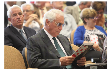
HOF trainer D. Wayne Lukas