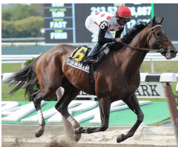
To Honor and Serve