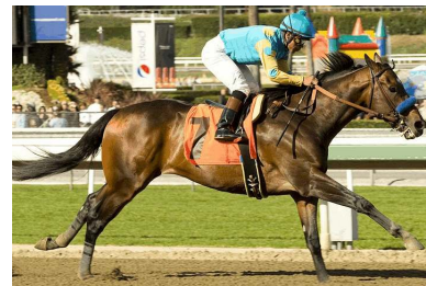
Paynter

Zayat Stables' Paynter (Awesome Again) will not contest the Aug. 25 GI Travers S. at Saratoga, confirmed trainer Bob Baffert yesterday. The stable, which also campaigns