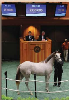
Hip #448 Tapit colt Purchased by Whisper Hill Farm