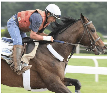
Travers hopeful Atigun