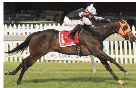
Sensible Lady