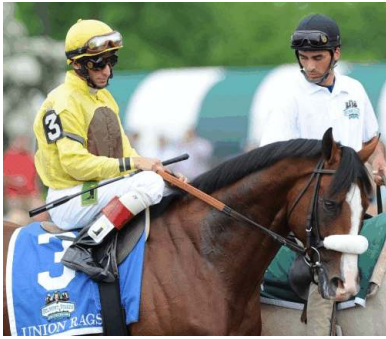
Union Rags prior to his Belmont win