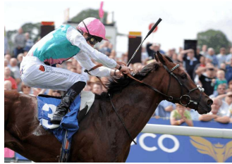
Dundonnell

Fresh off a track record-setting performance in breaking his maiden last time out, Dundonnell (First Defence) got owner Khalid Abdullah off to a flying start on International Day, becoming the first black-type winner for his freshman sire (by Unbridled's Song) in the G3 Acomb S. at York.