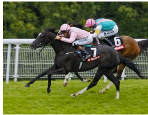
The Fugue

A quartet of sophomore fillies takes on a trio of older females in today's featured G1 Yorkshire Oaks on the Knavesmire, and Lord Lloyd-Webber's The Fugue (GB) (Dansili {GB}) looks to register her second stakes win at the venue, having looked so good in annexing the G3 Musidora S. this past May.