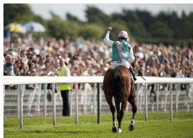
Frankel