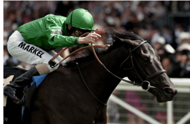
Newfangled

Princess Haya of Jordan's Newfangled (New Approach {Ire}) puts her unbeaten record on the line in today's G2 Lowther S. at York, escaping a penalty for her emphatic defeat of the well-regarded Agent Allison (GB) (Dutch Art {GB}) in Royal Ascot's G3 Albany S.