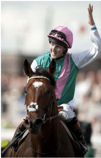
Frankel & Tom Queally

Despite never having raced beyond one mile, ★ "TDN Rising Star" ★ Frankel (GB) (Galileo {Ire}) didn't give connections, nor his burgeoning fan club, a moment's worry when streaking to yet another mighty impressive triumph in Wednesday's G1 Juddmonte International S. at York. Forty years after the great Brigadier Gerard (GB) met with his only career defeat on the Knavesmire, Juddmonte's world champion avoided