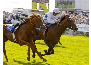
Thought Worthy (right)

Thought Worthy bagged a Newcastle maiden in his only juvenile go last October, but was caught out by the enterprisingly ridden Imperial Monarch (Ire) (Galileo {Ire}) in Sandown's G3 Classic Trial on sophomore return Apr. 28. He regained the winning habit, at the expense of Frankel's brother and his now-regular foe Noble Mission (GB) (Galileo {Ire}), in a thrilling renewal of the May 19 Listed Fairway S. at Newmarket, and shaped with credit, albeit no match for Camelot (GB) (Montjeu {Ire}), when fourth in the June 2 G1 Epsom Derby next time. Cont. p6