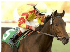
Turbulent Descent

With 8-5 morning line choice It's Tricky (Mineshaft) likely to scratch from today's G1 Ballerina S. in favor of Sunday's G1 Personal Ensign, the role of the favorite will likely fall to Turbulent Descent (Congrats). The $500,000 event is a "Win and You're In" race for the G1 Breeders' Cup F/M Sprint at Santa Anita Nov. 2. The 4-year-old filly makes her first start for