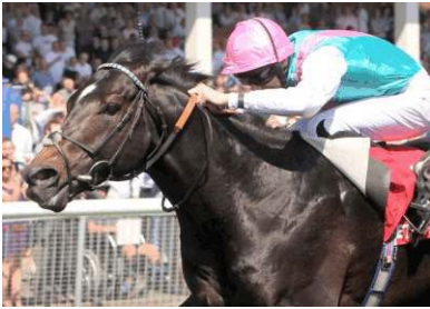
Bated Breath (GB) (Dansili {GB})--one of the favorites at York today

Breeders' Cup berths will be available today for some of the speediest runners out there on both sides of the pond. York's Friday highlight is the G1 Coolmore Nunthorpe S., a 20-runner affair whose winner gets a spot in the GI Breeders' Cup Sprint. Later in the day, the Saratoga feature is the GI Ballerina S., and the fastest filly there earns her place in the GI Breeders' Cup F/M Sprint.