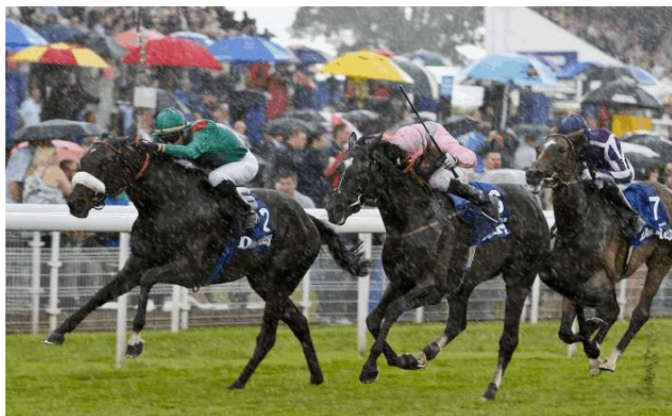
Shareta (rail) drives through the York rain